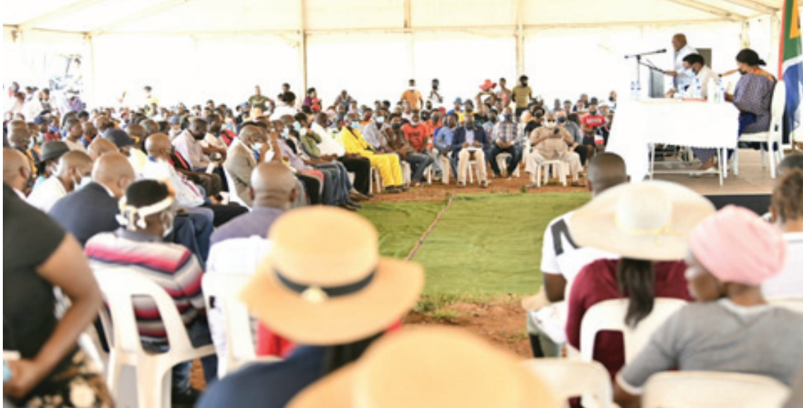
Premier Sihle Zikalala meets with residents of Nkunzana in oPhongolo, in an effort to resolve a prolonged land dispute which posed threat to the local economy and tourism in the area.