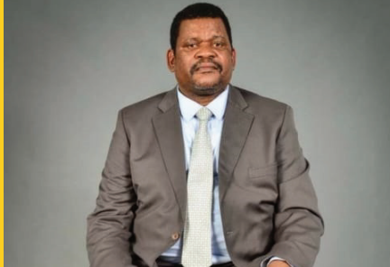
C.T.Zulu- King Support Services