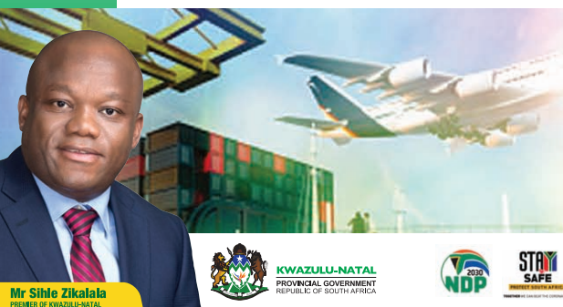
Mr Sihle Zikalala PREMIER OF KWAZULU-NATAL

"I went and bought a brand-new pair of shoes for my first day at work, and I wore a red and white outfit," she said with a smile as if reliving that day.